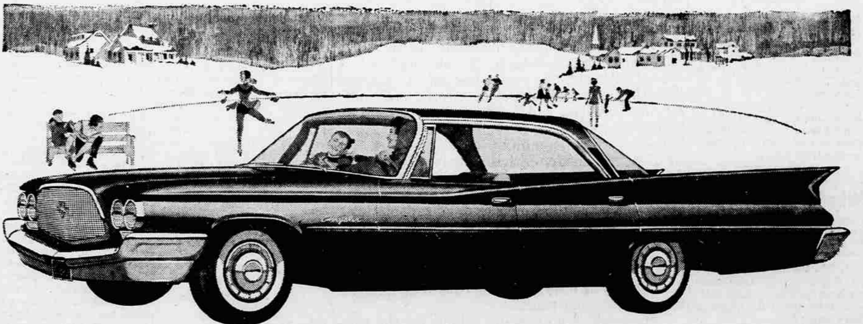
New Chrysler Windsor 4-Door Hardtop. Fresh, fiery beauty at a modest price.