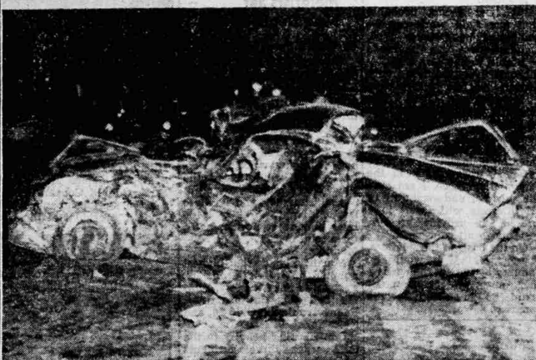
CRASH KILLS SEVEN — Seven persons died, deputies said the car in which they were riding apparently skidded on the road on a snow-swept road near Saginaw, Mich. Five young women riding in the car in the top photo were killed outright. Two men in the auto in the bottom photo also