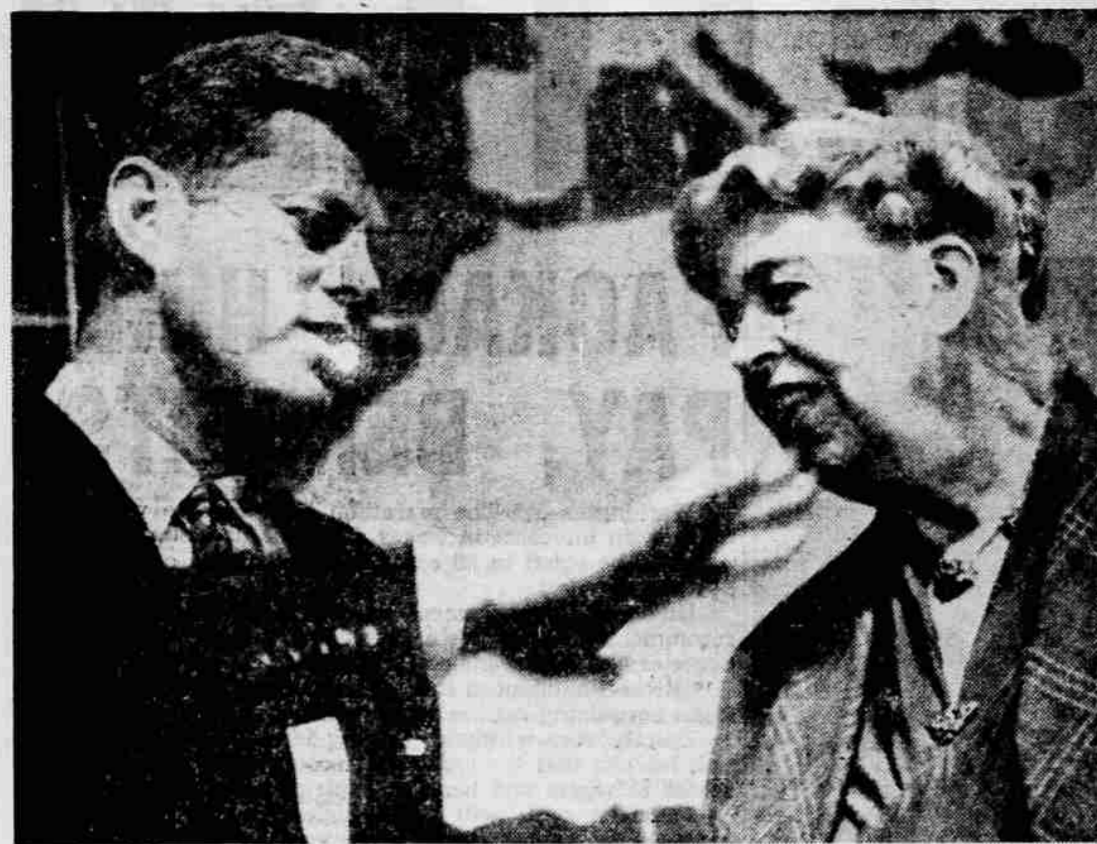
DEMOCRATIC MEETING — Sen. John F. Kennedy is shown exchanging views with Mrs. Eleanor Roosevelt shortly after he announced his candidacy for the Democratic nomination for President.