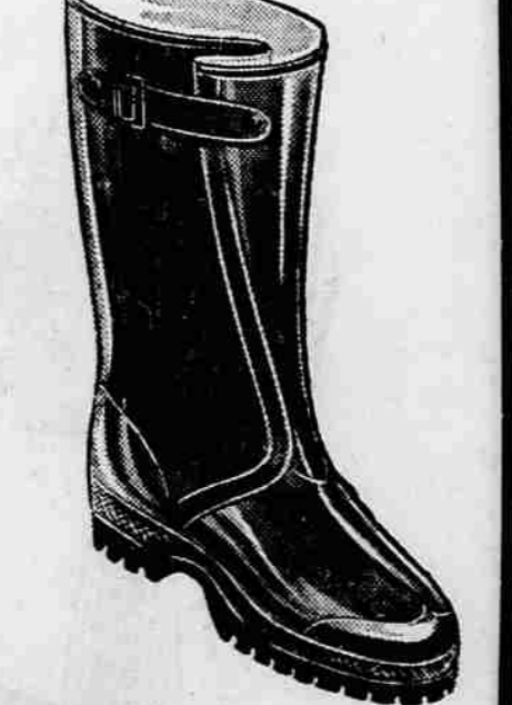
MEN'S EASY OFF AND ON GALOSHES

Keep your feet snug 'n dry in Penney's high quality galoshes. Check the waterproof gusset, fleecy cotton lining and heavy duty zipper. They're low Penney priced, too!