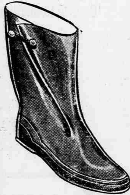
WOMEN'S THERMAL PLASTIC HIGH GALOSHES

NOW... WHEN YOU NEED THEM, PENNEY'S HAS THE RAIN AND STORM BOOTS YOU WANT... AT PRICES THAT SAVE YOU MONEY