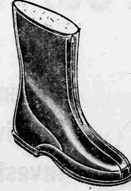
MEN'S ZIPPER FRONT DRESS GALOSHES

Penney's gives you more extras in these ruggedly built arctic fleecy cotton lining, waterproof gusset, light-weight construction. Compare 'em for quality and price! Men's, 6 1/2 to 10 ..... 5.79