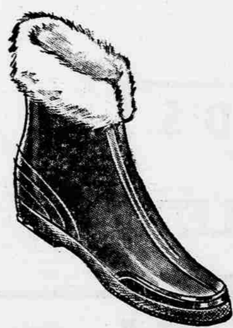
WOMEN'S DYNEL CUFFS ON RUBBER BOOTS!

Let it rain, rain, rain! These molded thermal plastic galoshes will keep your feet wonderfully dry and warm. Fun to wear, too! Red. Save, too! Girls - 7 to 4 - 3.29