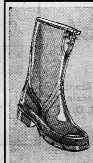
MEN'S CUSHIONED RUBBER PACS

... Thanks to Penney's new, super-smooth lining treatment! Sturdy plastic uppers get skid-resistant soles and heels, adjustable top with buckle fastener! Boys' sizes ..... 3.19