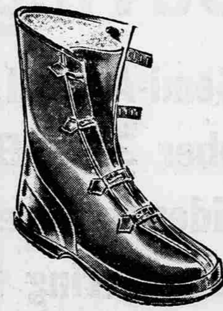
MEN'S - BOYS' 4-BUCKLE DRESS ARCTIC VALUE!

New lining treatment makes them slide on easy! Sturdy plastic. Skid-resist soles. White. Also available in Misses' sizes 1 to 4, and Child's 5 to 12. $2.99.