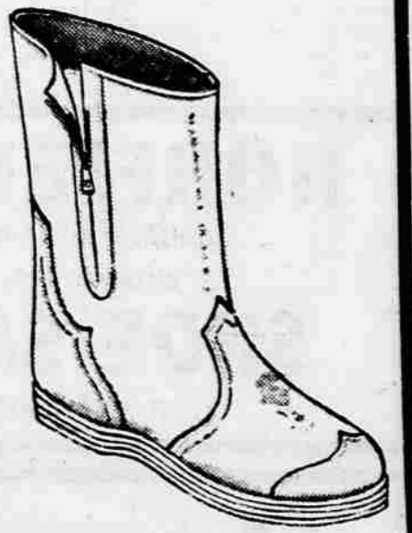
GIRLS' EASY ON 'N' OFF SIDE ZIP BOOT

Toasty warm, comfortable boots. Smartly trimmed with DYNEL cuffs that look like fur... feel so nice! Automatic lock fastener, waterproof gussets. You'd expect to pay more!