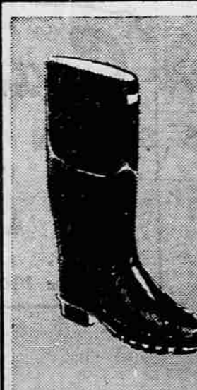
MEN'S - WOMEN'S AND BOYS' RUBBER BOOTS Men's Women's Boys'