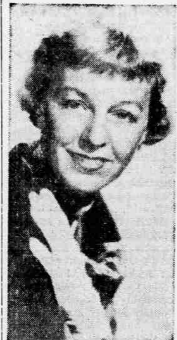
ACTRESS DIES — Miss Margaret Sullivan, above, one of the greatest actresses of the American stage, was dead on arrival at Grace-New Haven, Conn., hospital Friday. Miss Sullivan, 48, was scheduled to open Friday in the world premiere of "Sweet Love Remembered," at the Shubert theater in New Haven.

Earlier Friday she had been treated by a doctor for nervous exhaustion. Associates said the strain of a new role had taxed her strength.