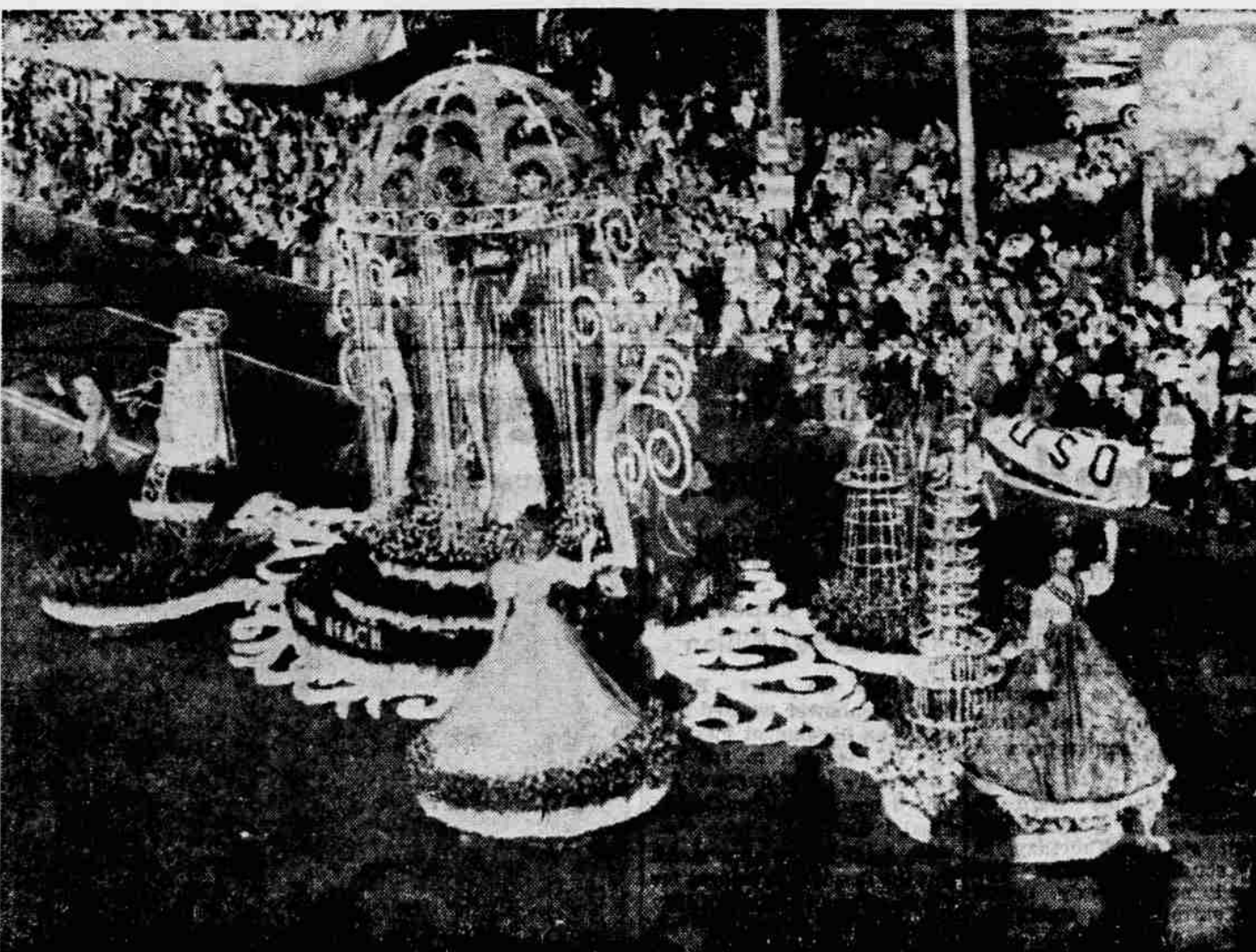
SWEESTAKES WINNER -The Sweepstakes winner, top prize in the Rose parade in Pasadena, Calif., was a float entered by the City of Long Beach, Calif., entitled "International Beauty-Venus De Milo," which is shown above passing along the parade route. The float emphasizes the annual beauty contest sponsored by the city.

The Association of American Railroads says that 850,000 new freight cars have been put on the tracks since the end of World War II.