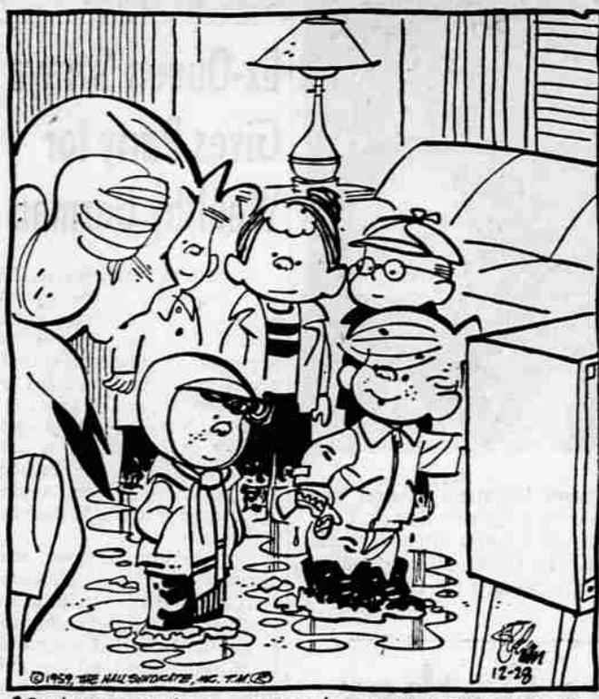
"DON'T WORRY, MOM... WE DON'T WANT ANYTHING TO EAT. WE'RE JUST GONNA WATCH TV WHILE WE GET WARMED UP!"