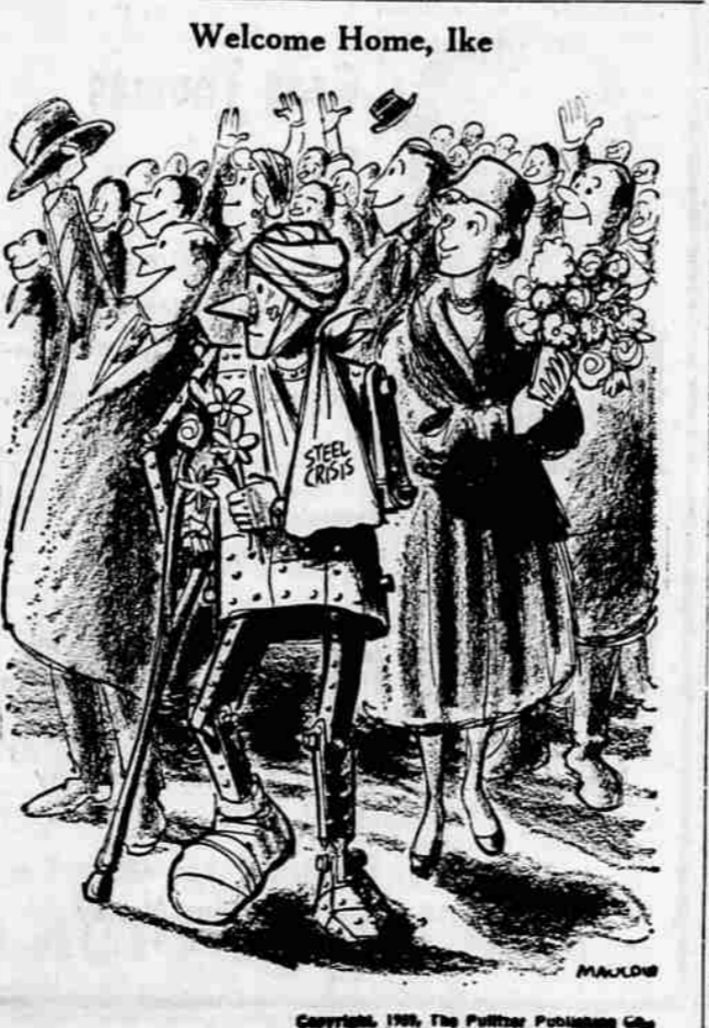
Welcome Home, Ike