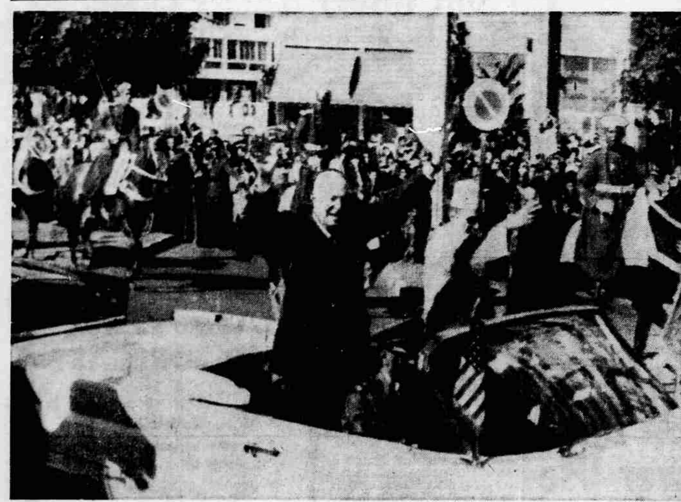
IKE GREET MOROCCANS —Escorted by Black Guards, President Eisenhower and King Mohammed V wave from a car as they ride in a motorcade at Casablanca today.

Round Butte Dam Permit Approved Salem - (UPI) - The three-member Oregon Hydroelectric Commission, over the objections of its chairman, today voted to issue a preliminary permit to Portland General Electric company for proposed Round Butte dam on the Deschutes river.