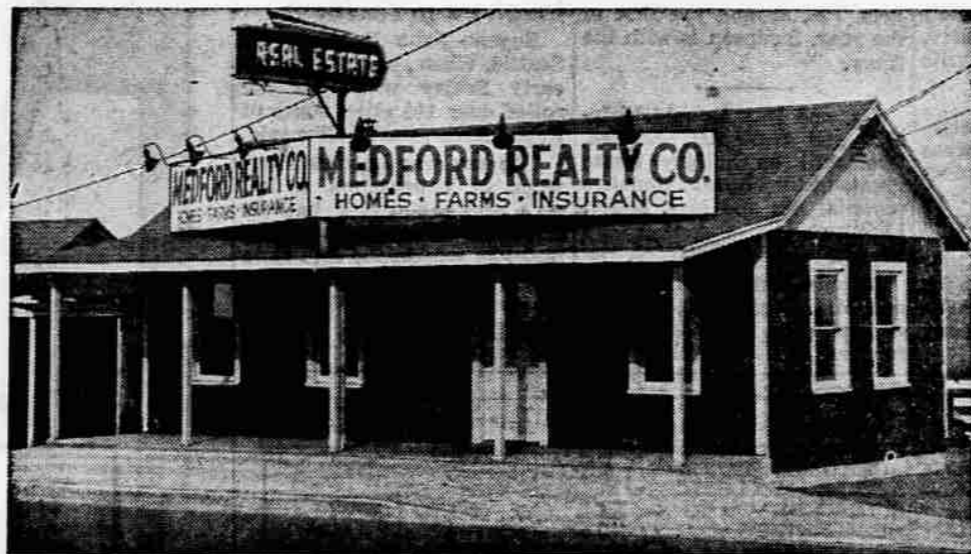
1045 S. RIVERSIDE • PHONES P 2-5750