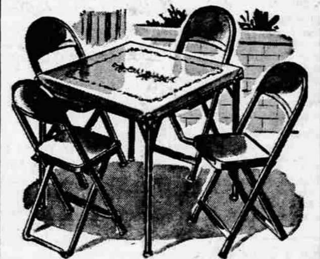
TABLE - 4 CHAIRS - Large Selection Types and Styles