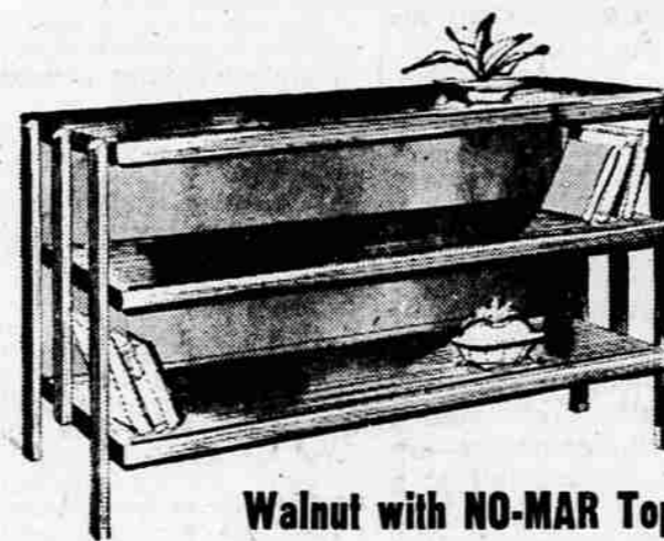
Walnut with NO-MAR Tops