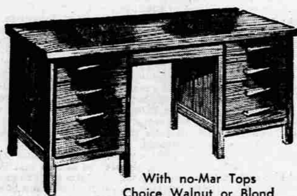
With no-Mar Tops Choice Walnut or Blond