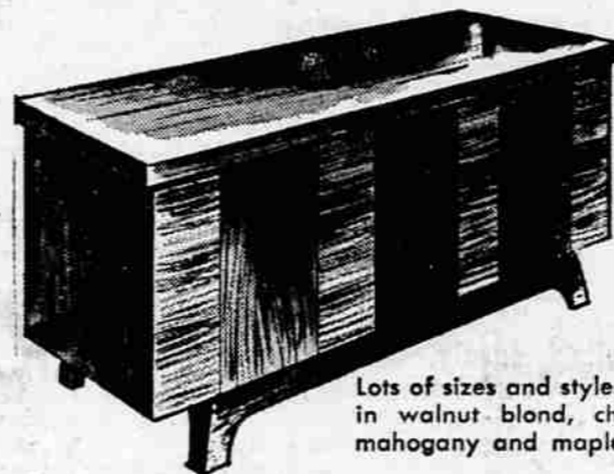
Lots of sizes and styles ... in walnut blond, cherry, mahogany and maple.