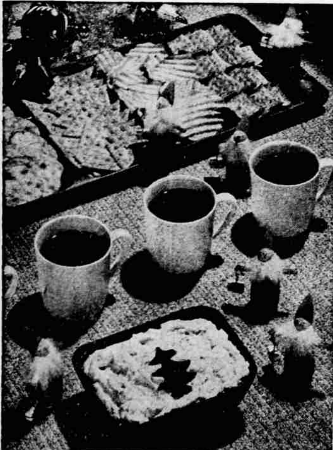
DIP MIXES —Dips and dunks have been going to parties for many years. They're so popular that dip mixes are now available along with the salad mixes, spaghetti sauce mixes, spreads and beverage mixes. Festive party makings for all the family are discussed in today's food columns.