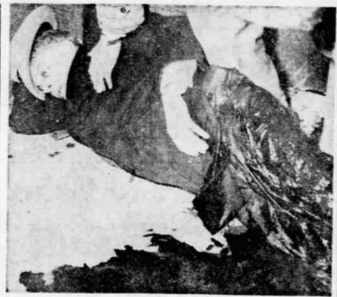
IN POOL OF BLOOD —Roger Touhy lies in a pool of blood minutes after being gunned down in a Chicago residential neighborhood. Touhy was released from prison 23 days ago after serving 25 years for kidnaping Jake "The Barber" Factor. See picture on page 2.