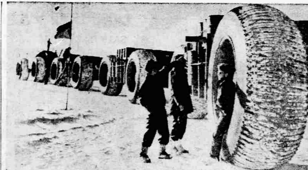
ARCTIC TRANSPORTATION—A huge U.S. Army Logistical Cargo Carrier (overland train) transports supplies during test and training exercises in the Arctic. Three soldiers stand next to the large wheel on the vehicle measuring 9½ feet in diameter.

Eight all-steel cabooses now in use on the Bangor and Aroostook Railroad in Maine were troop sleepers during World War I.