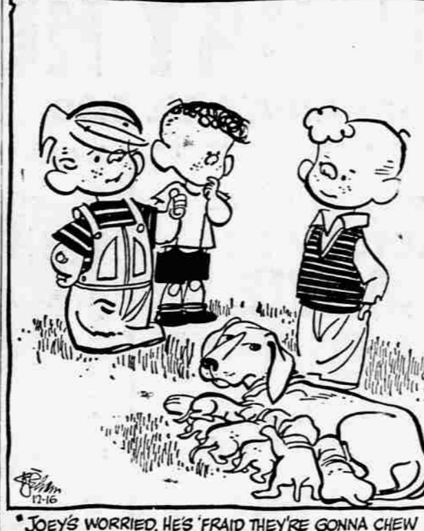
JOEY'S WORRIED, HE'S 'FRID THEY'RE GONNA CHEW THE BUTTONS OFF HER VEST!