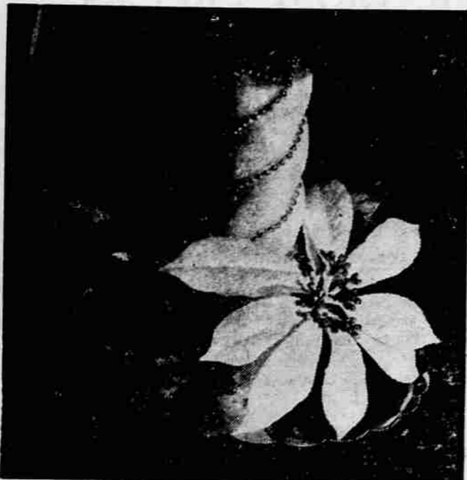
Mrs. Howard Bush entered a table arrangement in the Christmas show of Medford Garden club held last week at the Jackson County courthouse auditorium. Mrs. Bush wrapped a large white candle in silver beads and arranged the candle, a large artificial poinsettia blossom and green and red leaves on a silver tray. About 100 exhibits were entered.

A candy for holiday time which is different, and can be something special, is an easy "sugar plum" dainty, made from dried fruits, almonds and sugar. The holiday candy fruit balls call for one pound assorted dried fruits (prunes, apricots, citron, pears, or others), 1/2 cup almonds and two cups of sugar. Put fruit and almonds through meat grinder. Place in top of double boiler with sugar. Cook, stirring constantly, until sugar is dissolved, about 15 minutes. Cool and shape into balls and roll in granulated sugar. The recipe yields approximately 46 one-inch balls.