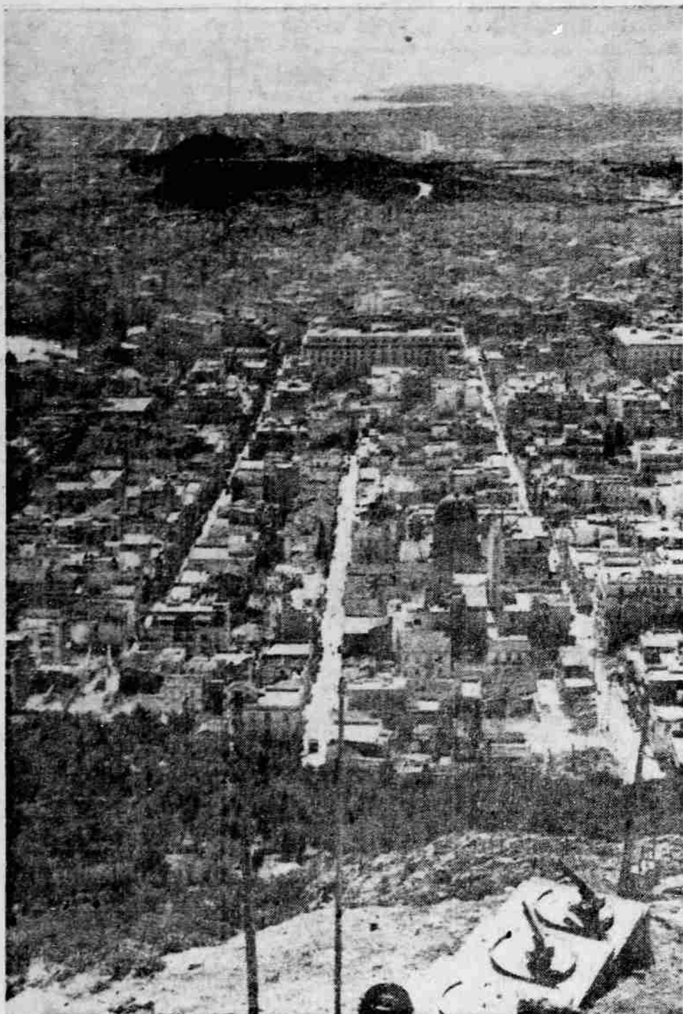
SEVENTH STOP —Greece is the seventh of the 11 countries on President Eisenhower's travel calendar. This general view shows the city of Athens, from the top of Mount Lycabettus. The Acropolis is visible in the background.

Greece, a nation slightly larger than New York state, gave the Western world the foundation of its governments, its art and architecture, its philosophy, its science and its political thought.