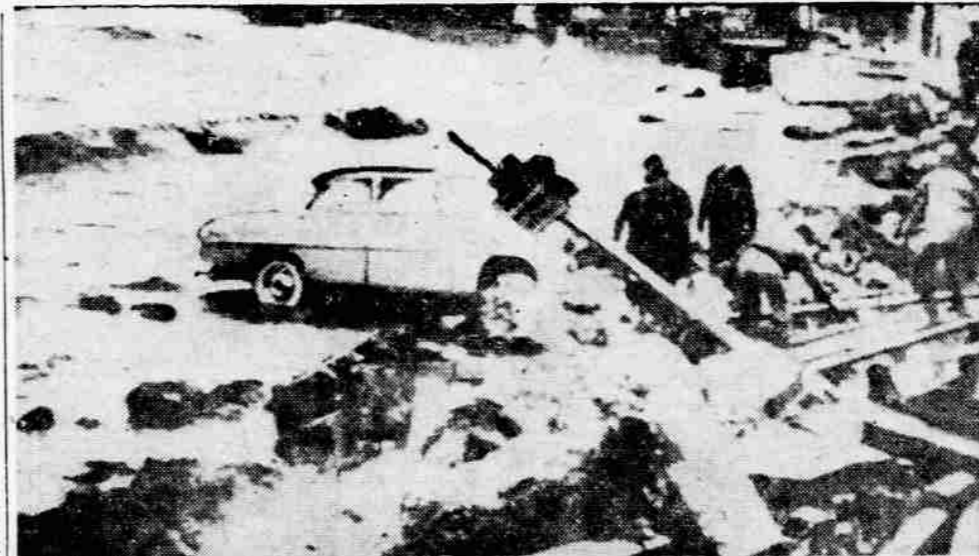
FLOOD WATERS WRECK PIER —Men stand amid the shattered wreckage of a pier at Ste. Maxime, France, following bursting of the Malpasset dam. Ste. Maxime is about 20 miles from Frejus, the town inundated by raging waters from the broken dam.