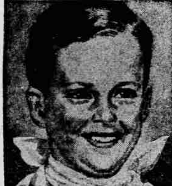
Little Billy has joined the "clean your plate club" since taking BITE-A-MINS.

Here's welcome news! Your children need never know they're taking vitamins. BITE-A-MINS, the candy-like Vitamin Tablets, come in four taste-tempting colors: yellow, pink, grape and orange (Each bottle contains complete assortment). One BITE-A-MIN per day is sufficient. Let them "PICK" the color of their choice—it's like a game. Today they'll love yellow, tomorrow, grape, etc., etc. But, whatever color they select, you'll know they're getting their minimum daily requirement of vitamins and minerals, plus L-lysine, the wonder additive which makes them want to eat. Get ready for clean plates, when you serve your children BITE-A-MINS.