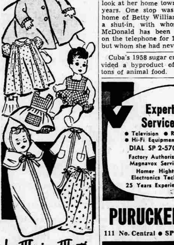
INFANT DOLL WARDROBE 9391 FOR DOLL 10"-20" TALL

Just watch a little girl's eyes light up when she sees this beautiful baby-doll wardrobe on Christmas. Includes coat, hat, dress, bunting, play-suit, pants. Tomorrow's pattern: Child's robe.