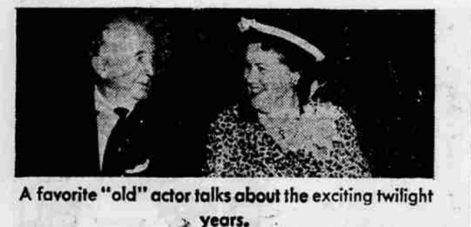
A favorite "old" actor talks about the exciting twilight years.

"Retire?—sure, but not from life!" by Walter Brennan