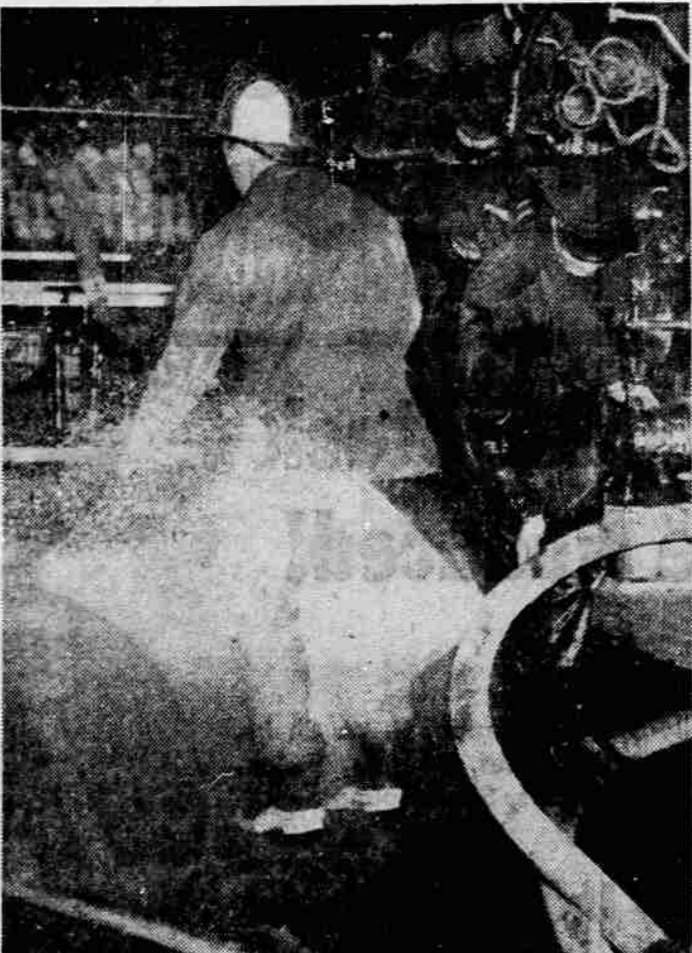
FIREMEN DRENCHED - An unexpected shower drenches unidentified firemen during a fire at a laundry in San Francisco. The break in the hose widened to deluge proportions within moments. The fire, fought by 70 firemen, damaged delivery trucks as well as piles of linen with destruction estimated at $10,000.

He tutted and replied: "That's an unfair question."