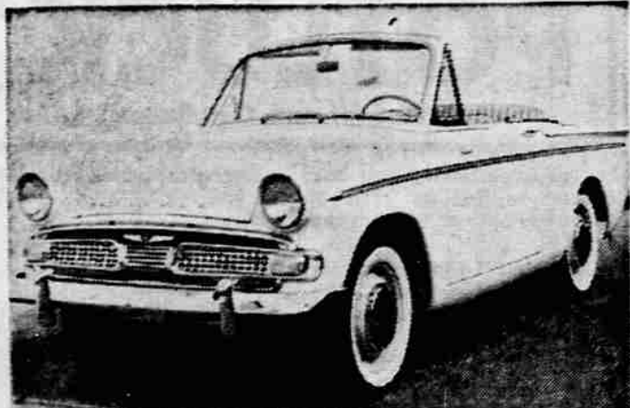
HILLMAN - The 1960 Hillman is on display at Parson Motors, 315 East Fifth st. The new British car has a wider windshield and the brake lining has been increased on the deluxe models, it was reported. Horsepower of the vehicle has been increased to 56 horsepower and several new color combinations are available. Several models of the automobile are available including station wagons.