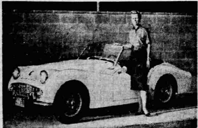
TRIUMPH - The 1960 Triumph is now on display at Keith Schulz, Triumph Sales and Service, 116 North Front st. The roadster shown is the TR3 model which features a 100 horsepower engine.