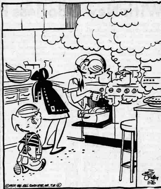
"MUMM, BOY! IT SURE SMELLS HAPPY IN HERE!"