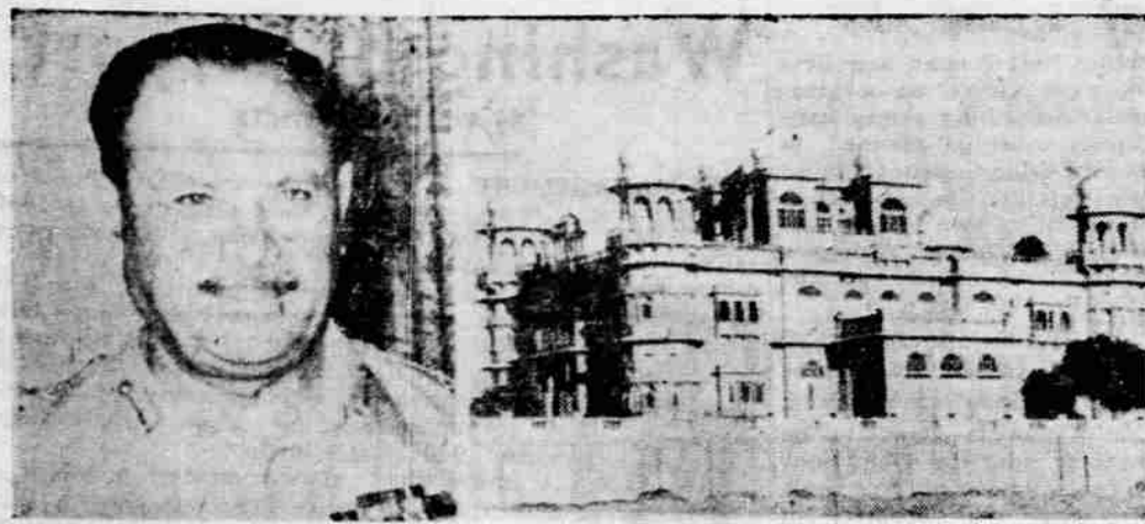
STOP ON IKE'S TOUR —Pakistan, strongest Western ally on the Asia mainland, will be visited by President Eisenhower during his goodwill tour next month. The government is under control of Army Commander-in-Chief Gen. Mohammed Ayub Khan, left. The building shown at right is known as the Mohatta Palace and houses the Ministry of Foreign Affairs.