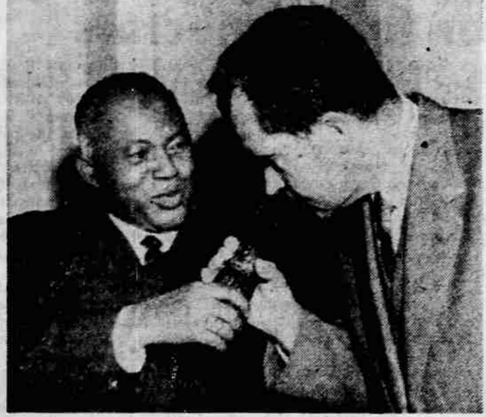
VISITS NIXON —Philibert Tsiranana, president of Madagascar in the French community, visited Vice President Richard M. Nixon at the capitol Thursday, bringing with him a bag of pure vanilla beans, which the vice president is shown sniffing. Vanilla beans are Madagascar's principal export to the U.S.