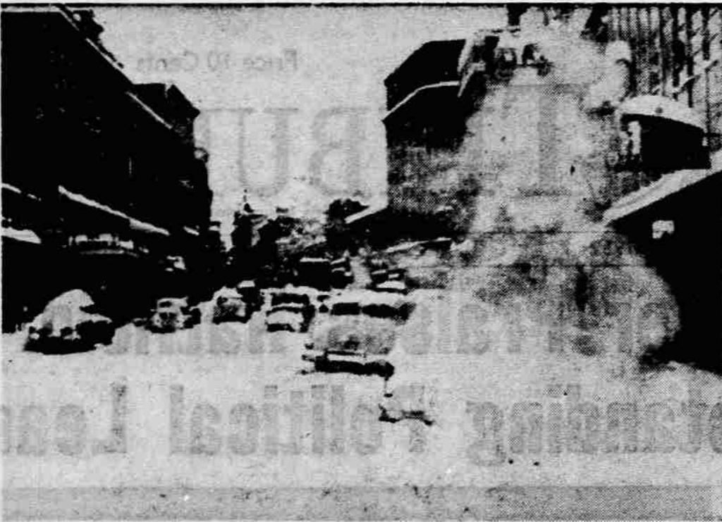
SNOW COVERED —The main street in Helena, Mont., is covered with snow as the whole state freezes. The lowest temperature was 37 degrees below zero at Butte, Mont., and the warmest spot was Glasgow, Mont., with a frigid 6 degrees below zero.