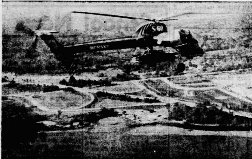
AIR TRANSPORTATION —Winging high flight across the countryside. Proving that over the Housatonic river at Stamford, Conn., a Sikorsky S-60 crane helicopter and the big whirlybird zipped along at 100 miles an hour with the auto in tow.

Mrs. Charles Offenbacher was presented a yellow chrysanthemum corsage with blue Webelo emblem by Charles Offenbacher. A Gold Webelo emblem was also given to