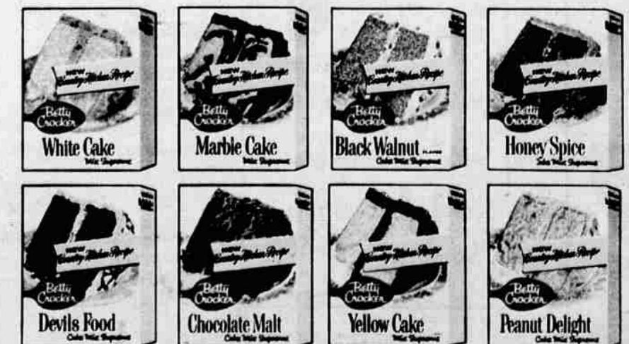
Actual photograph of our eight new Betty Crocker Country Kitchen Cakes.

Look for these new packages at your grocery store