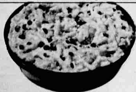
Tuna Confetti Casserole. Prepare 1 package Kraft Dinner as package directs. Combine with 2 cups hot, cooked peas, one 7-ounce can of flaked tuna, a 10½-ounce can condensed cream of celery soup, ½ cup milk, 2 T. chopped pimiento, ½ tsp. salt. Bake in greased casserole in moderate oven (350°), 25 to 30 minutes.