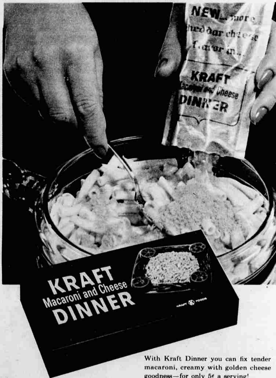
With Kraft Dinner you can fix tender macaroni, creamy with golden cheese goodness—for only 5¢ a serving!