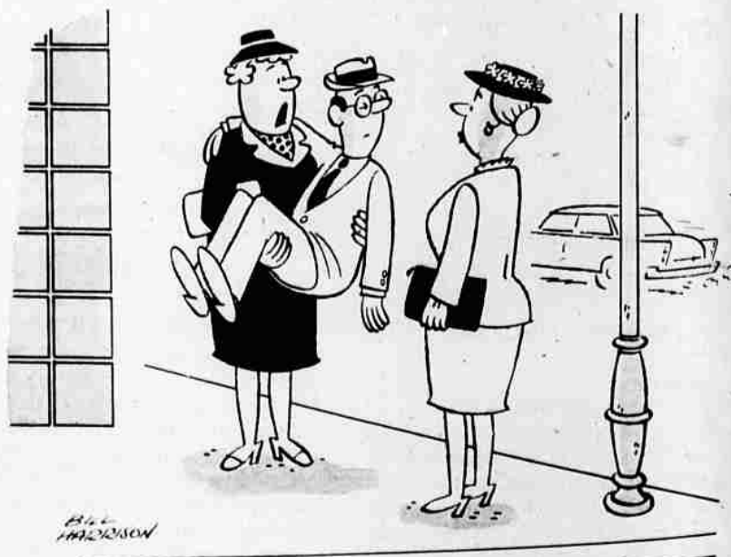
"The doctor told him to stay off his feet."

"No, but it's unusual," the girl replied. "I don't feel a thing, but when Mommy stands on it, it makes her mad."—Nuggets