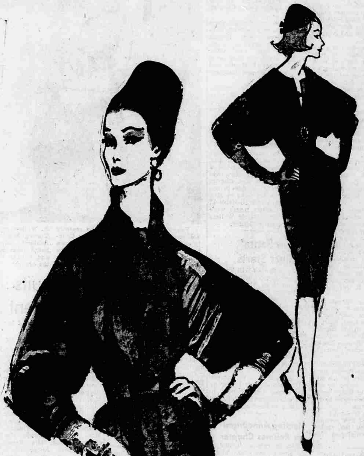
Ricci, dramatic bat-wing sleeves, wide belt moving waist upward 79.95.

Railroads in the United States were using 23 different gauges of track in 1871.