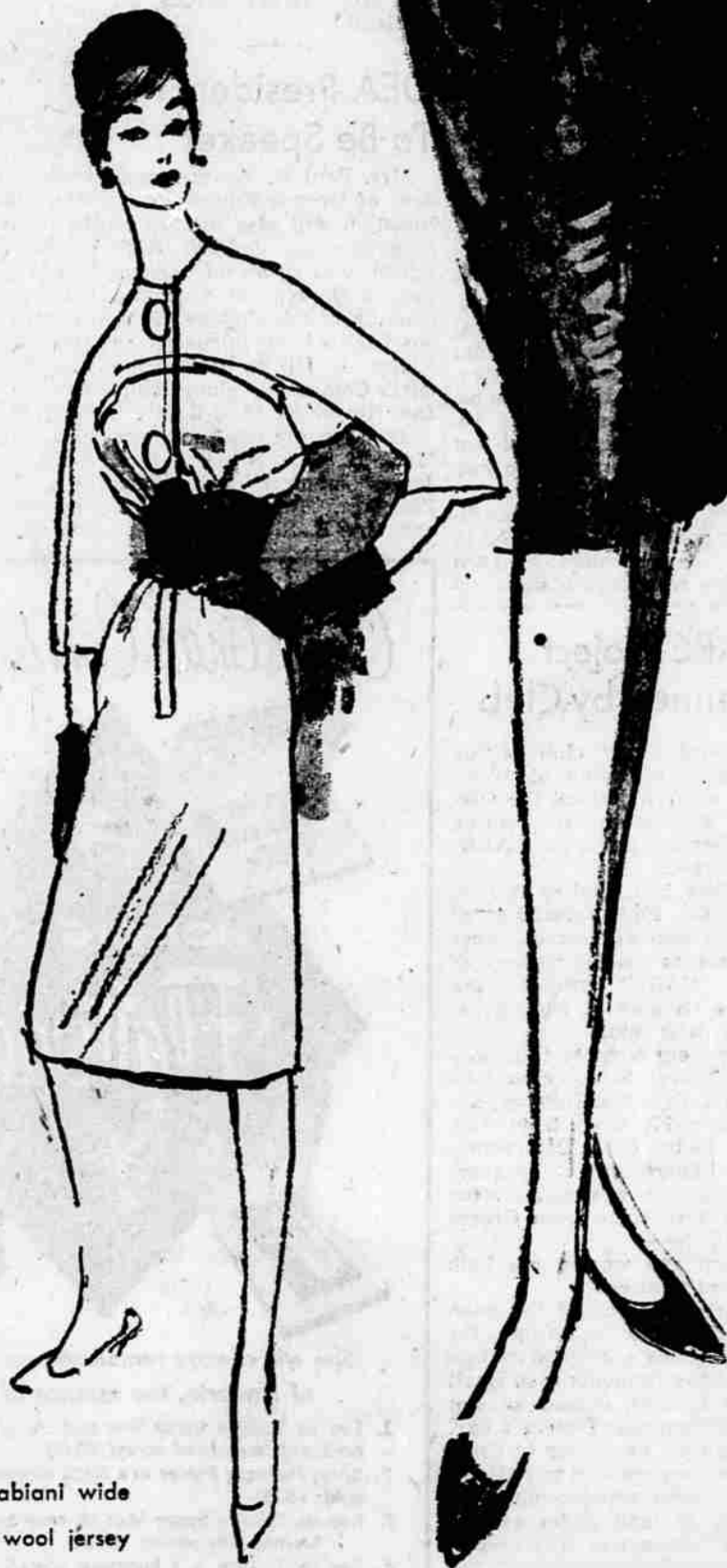
Fabiani wide belt wool jersey casual 39.95