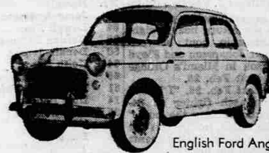
English Ford Anglia

The six Alpine countries of Europe are Austria, France, Germany, Italy, Switzerland and Yugoslavia.