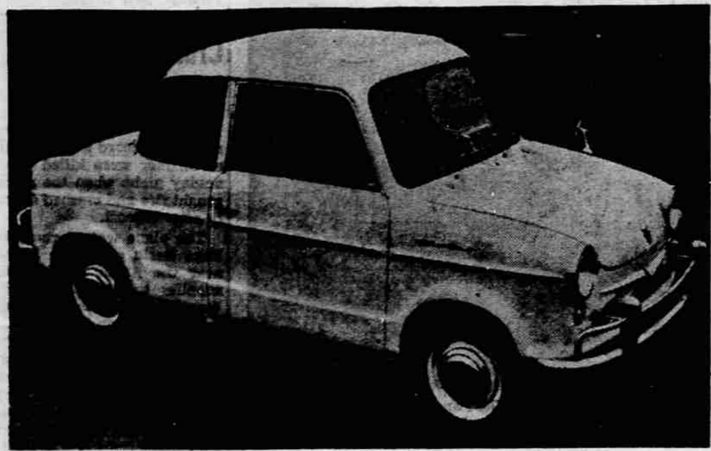
ON DISPLAY —The 1960 NSU Prinz is now on display at White's sales and service, 3330 North Pacific highway, Medford. The car, which is made in West Germany, offers unit construction, alloy over head cam engine, four-speed syno-mess transmission, and alloy finned brakes.