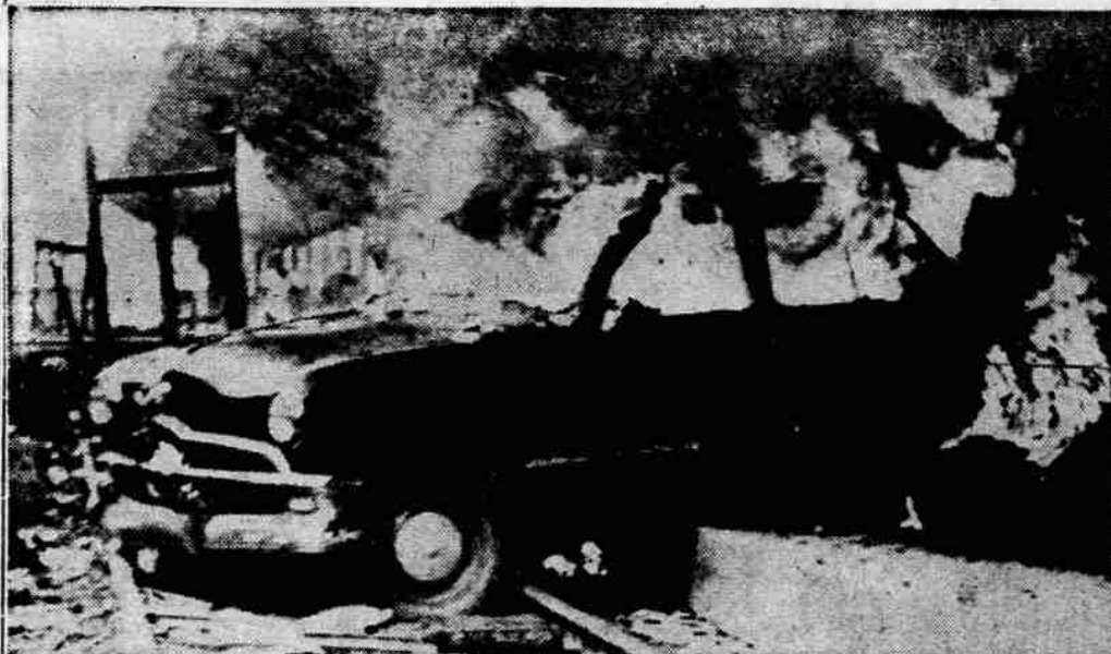
PANAMA RIOTS — An automobile is shown burning in a Panama railroad station at Panama City during the rioting there Tuesday. The Panama railroad is part of the Panama Canal Enterprises.

FOR YOUR BAKING OR SNACKING — NEW CROP — CALIFORNIA DATES PEANUTS WALNUTS PECANS ALMONDS BRAZIL NUTS FILBERTS COCONUTS CHESTNUTS