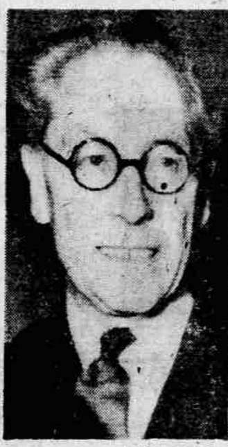
PHILIP NOEL-BAKER Long-Time Peace Worker

That's why, he said, the Western Allies are meeting in Paris Dec. 19 to coordinate their positions on critical issues.