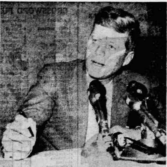
'TOUGH COURSE' SEEN —Speaking before a $100-a-plate Jefferson-Jackson Day dinner in Los Angeles, Sen. John Kennedy warns that the United States faces a "tough course ahead, for a generation or more, against Soviet advances." He declared, "we have gone soft—physically, mentally, spiritually soft." The 42-year-old front runner for the Democratic presidential nomination said that "the slow erosion of luxury, the slow erosion of our courage"—is already beginning to show.