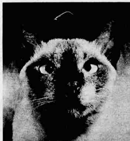
Although good conversationalists, some are hard to look straight in the eye.