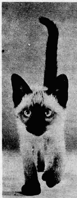
A well-marked Siamese looks as if he put snoot in soot.

They're pure white at birth and sometimes cross-eyed. But as their colors come and they begin flexing their muscles—and voices—they turn into what one author has called "the gayest thing on earth."