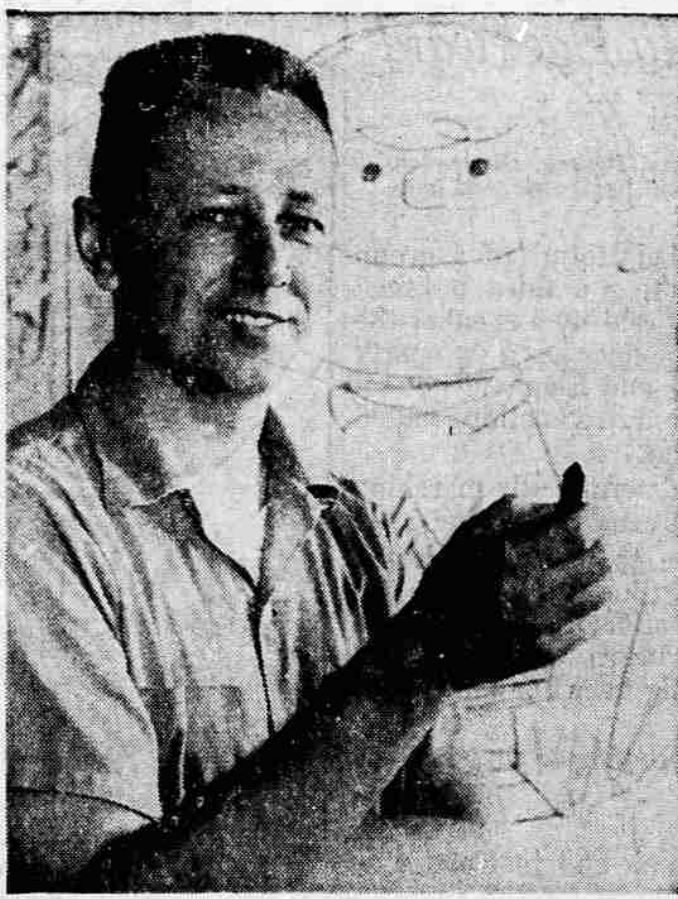
CHARLES M. SCHULZ Creator of Peanuts

Schulz, who now lives in Sebastopol, Calif., starts work about 6:30 a.m. daily and works about an eight-hour day. Sometimes, he said, he can turn out two or three strips in that time, when ideas come fast, and sometimes he discards everything because it does not meet his standards. The comic-strip "Peanuts" will start daily in Mail Tribune tomorrow.