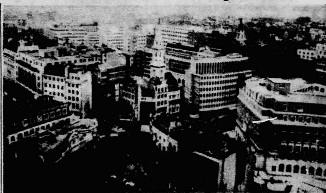
REBUILDING PROGRESS —This panoramic view, from St. Paul's Cathedral, shows the progress which has been made in rebuilding parts of London which were badly damaged during World War II. The Ger-

By GREGORY JENSEN United Press International London—UPI—The Germans bombed London in a haphazard, piecemeal way. Planes, buzz bombs and V-2 rockets indiscriminately peppered the sprawling city with destruction. London is being rebuilt in the same way—haphazardly and piece by piece. Architects shudder at many of the new buildings. Civic planners are appalled. Buildings are springing up with no overall plan and in architectural styles that defy description. The rate of construction in London today is greater than at any time since the war. And the job is far from finished.