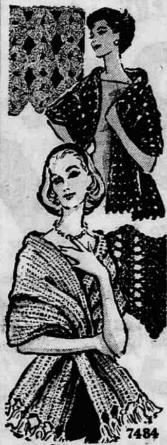
by Alice Brooks

Wrap your shoulders in a cozy, luxurious stole—so smart—so practical the year 'round. JIFFY STOLES —one to knit, one to crochet. Use knitting worsted, large needles—both in easy pattern stitch. Ideal gifts. Pattern 7484: directions.