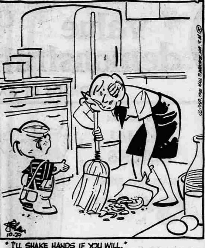
"I'LL SHAKE HANDS IF YOU WILL."