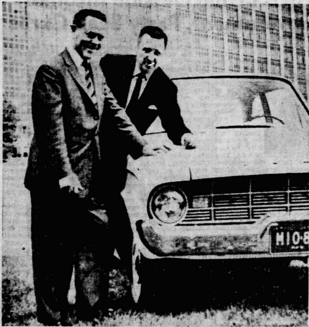
SEES FOREIGN CARS —Henry Ford II, president of Ford Motor Co., and Board Chairman Ernest R. Breech, left, stand next to the company's new economy car, the Falcon, which went on display in dealers' showrooms Oct. 8. Ford said that introduc-

tion of the new American-built economy cars eventually will virtually eliminate the use of small foreign cars for basic transportation in the United States.