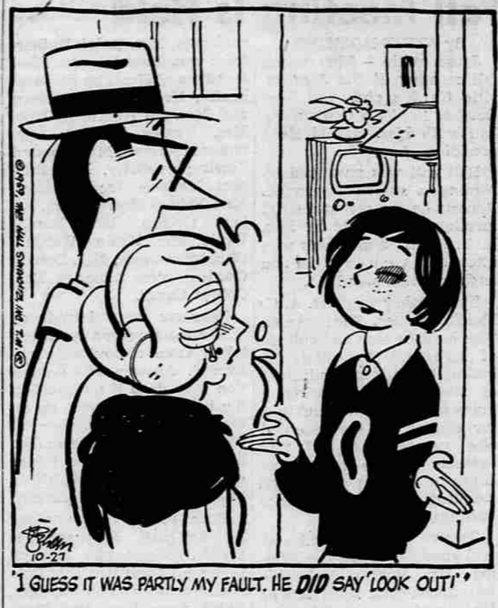
"I GUESS IT WAS PARTLY MY FAULT. HE DID SAY 'LOOK OUT!'"