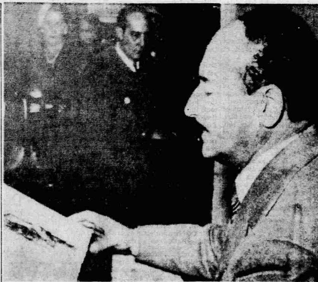
NOBEL WINNER —Italian Poet Salvatore Quasimodo, 58, has been awarded the 1959 Nobel Prize for Literature. The award was announced Thursday by the Swedish Academy of Literature. Quasimodo, the first Italian in 25 years to win the coveted $42,610 literature prize, teaches Italian literature at Milan's musical conservatory.

Washington —(UPI)— The Federal Communications commission has turned down a request from the Joint Council on Educational Television for a special probe of TV channel allotment for non-commercial use. The FCC said Thursday it already was studying the problem with a view to formulating new rules and standards for both commercial and educational TV.