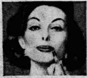
Outline lips in 3 strokes!