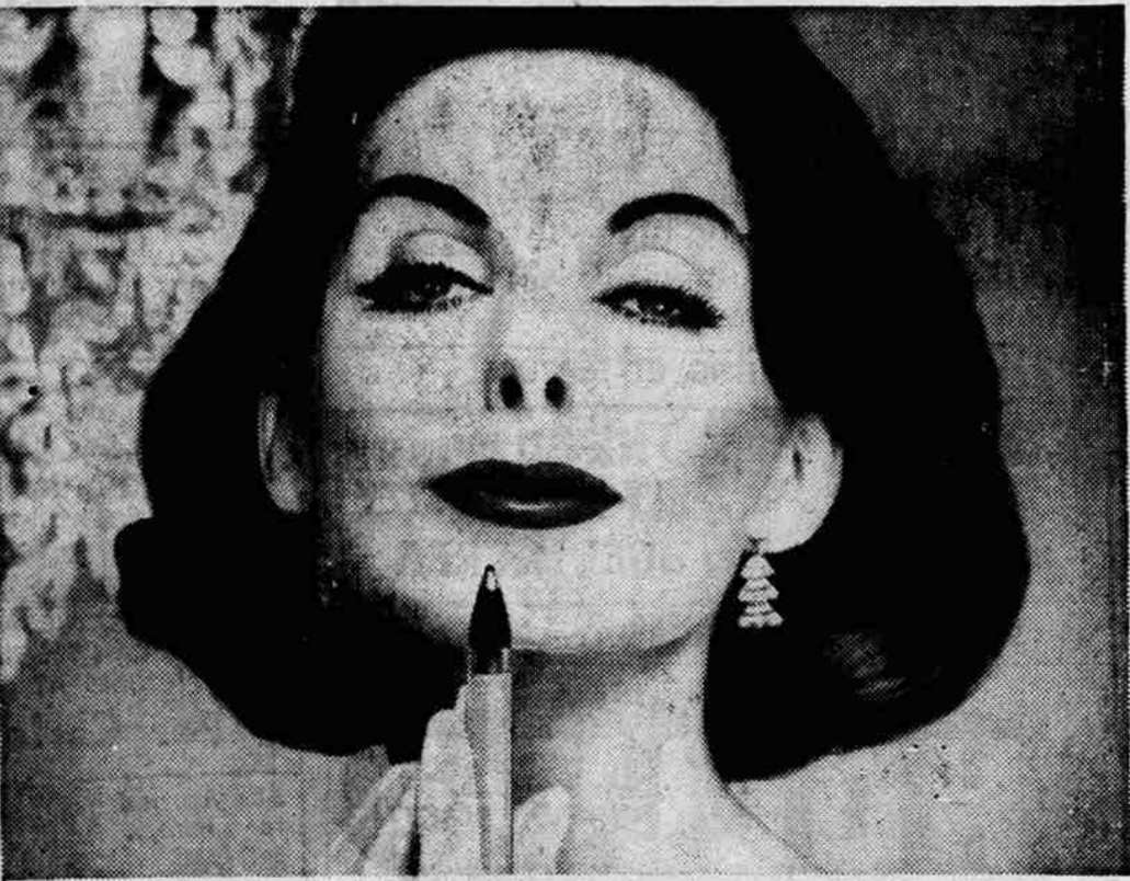
Sensational new kind of lipstick. Rolls on flowing color smoothly, cleanly, quickly