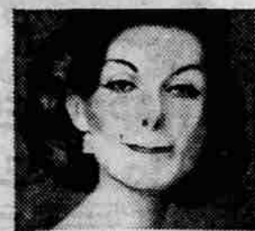
Press lips together!