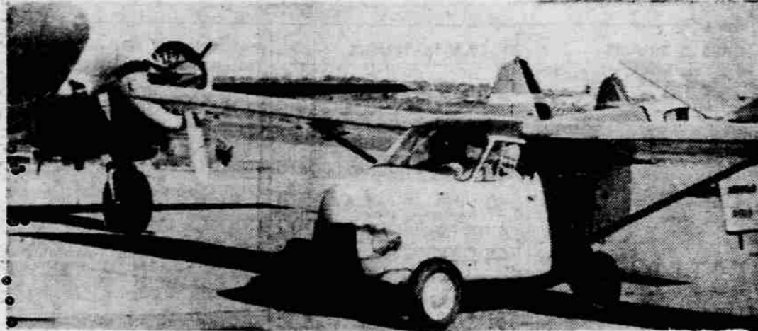
IN SKY OR ON LAND —The Aerocar, flying automobile, taxis after landing at Boston's Logan airport, top photo, The Aerocar, ready for flying, has an overall length of 21 feet, six inches and a wingspread of 34 feet. After five minutes of adjustments after landing, it is ready to face road traffic. Lower photo shows the Aerocar as it leaves the airport to head into Boston traffic. When wings are folded it has a length of 26 feet.