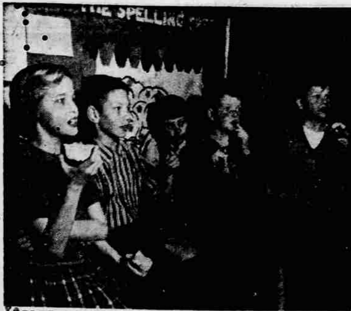
APPLES ACCENTUATED —Today's lesson accentuates the positive attractions of the apples of our Pacific Northwest. Most versatile of fruits, eaten for zest and flavor, apples also are packed with good nutrition.