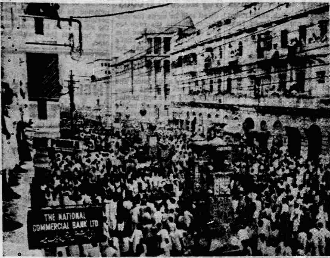
ASHURA OBSERVED - Karachi's main thoroughfares are clogged with processions and onlookers observing Ashura, the commemoration of the martyrdom of Imam Husain, grandson of the Prophet Mohammed. Carts and bearers are drawing great ornate "tazias" down Bunder rd. to the bay to be cast into the sea.