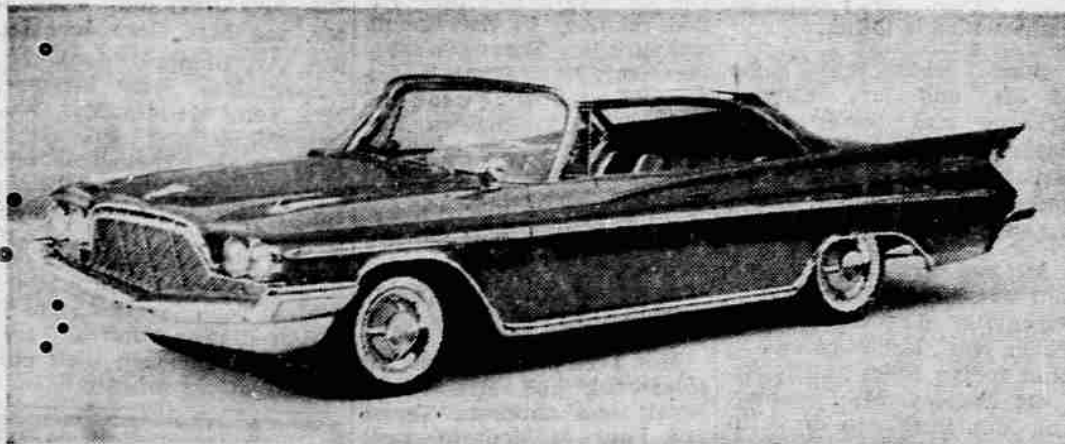
NEW DeSOTO —Now on display at the Dick Knight company, 33 South Riverside ave., Medford, is the 1960 DeSoto, which features the one-piece Unibody construction, improved Torsion-Aire suspension and new Ram Charge engine. A new radiator grille and long, swept-out fins are among the new exterior styling changes for DeSoto, available in the Firelite and Adventurer series in 1960. Shown above is the Adventurer two-door hardtop coupe.