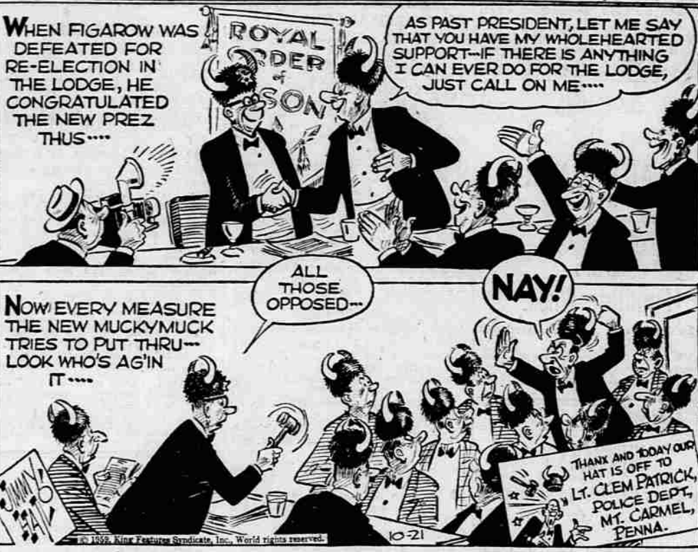
By JIMMY HATLO Copyright © 1959, King Features Syndicate, Inc. World-wide syndicated.