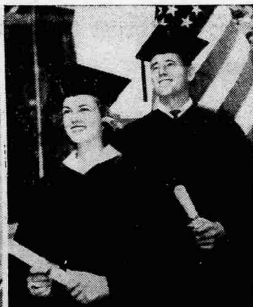
a college education...