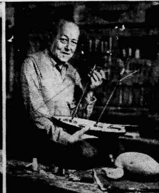
a comfortable retirement

Join the 23 million Americans who save at associations like ours where their money is safe and earns excellent returns.