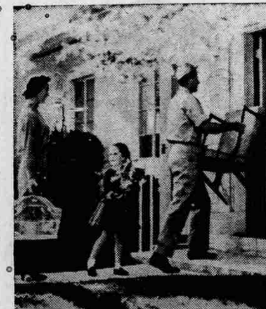
a new home...