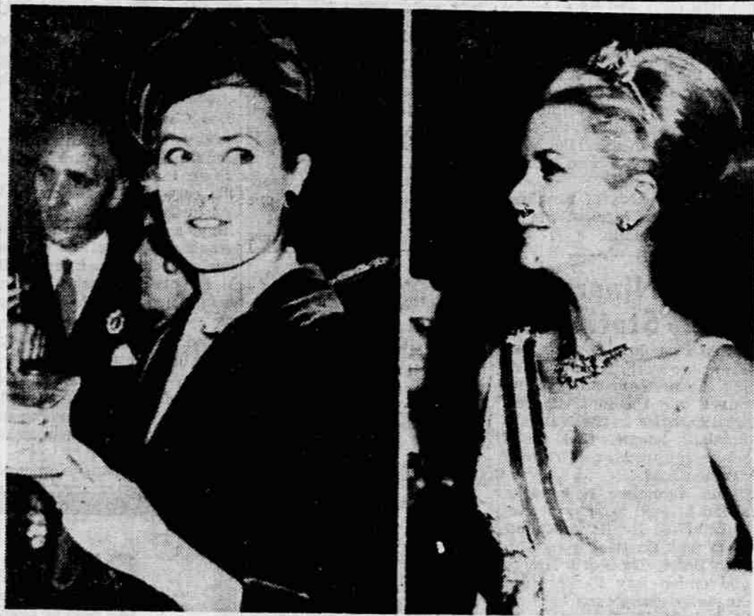
Paris—Princess Grace of Monaco, in Paris with her husband, Prince Rainier, on an official visit, made the rounds of society in plenty of style. The photo at left shows her wearing a tailored ensemble at an official reception given by the Paris Municipal council in City Hall. At right she wears a diamond tiara with formal attire at President Charles De Gaulle's reception in honor of the Prince and Princess of Monaco at the Elysee Palace.